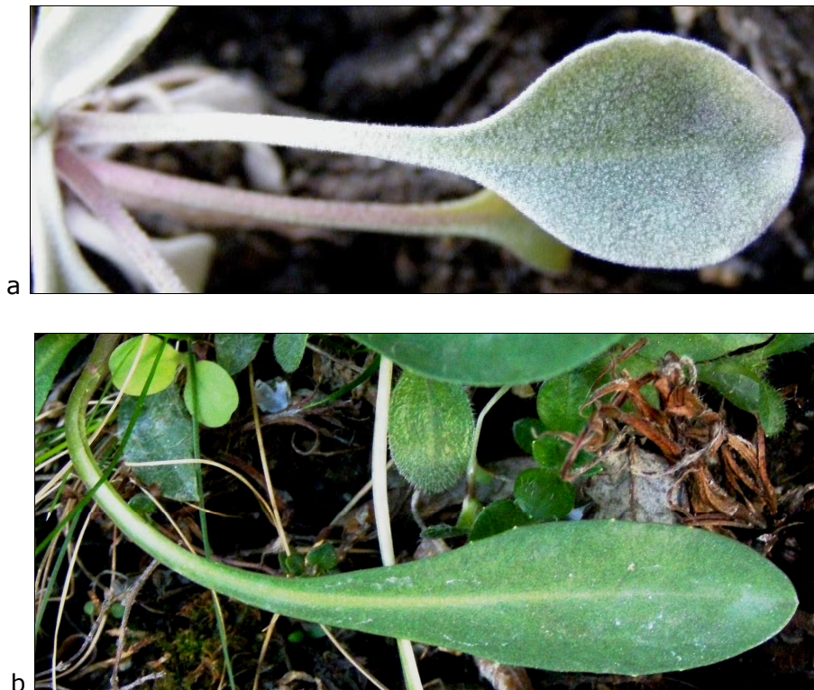
Figure 2. Spatulated leaves: a – P. levitomentosa , b – H. aurantiacum (original)

All previous aspects are particularly important for P. levitomentosa Nyárády ex Sennikov, because of its reproduction restricted to vegetative means (ramets) at the expense of seedling (genets). The species may have already lost the ability to reproduce sexually. We have made experiments with seeds of P. levitomentosa Nyárády ex Sennikov but without success. As we observed in the natural populations, the species produces flowers and seeds, but every time we collected seeds we noticed they were not viable.